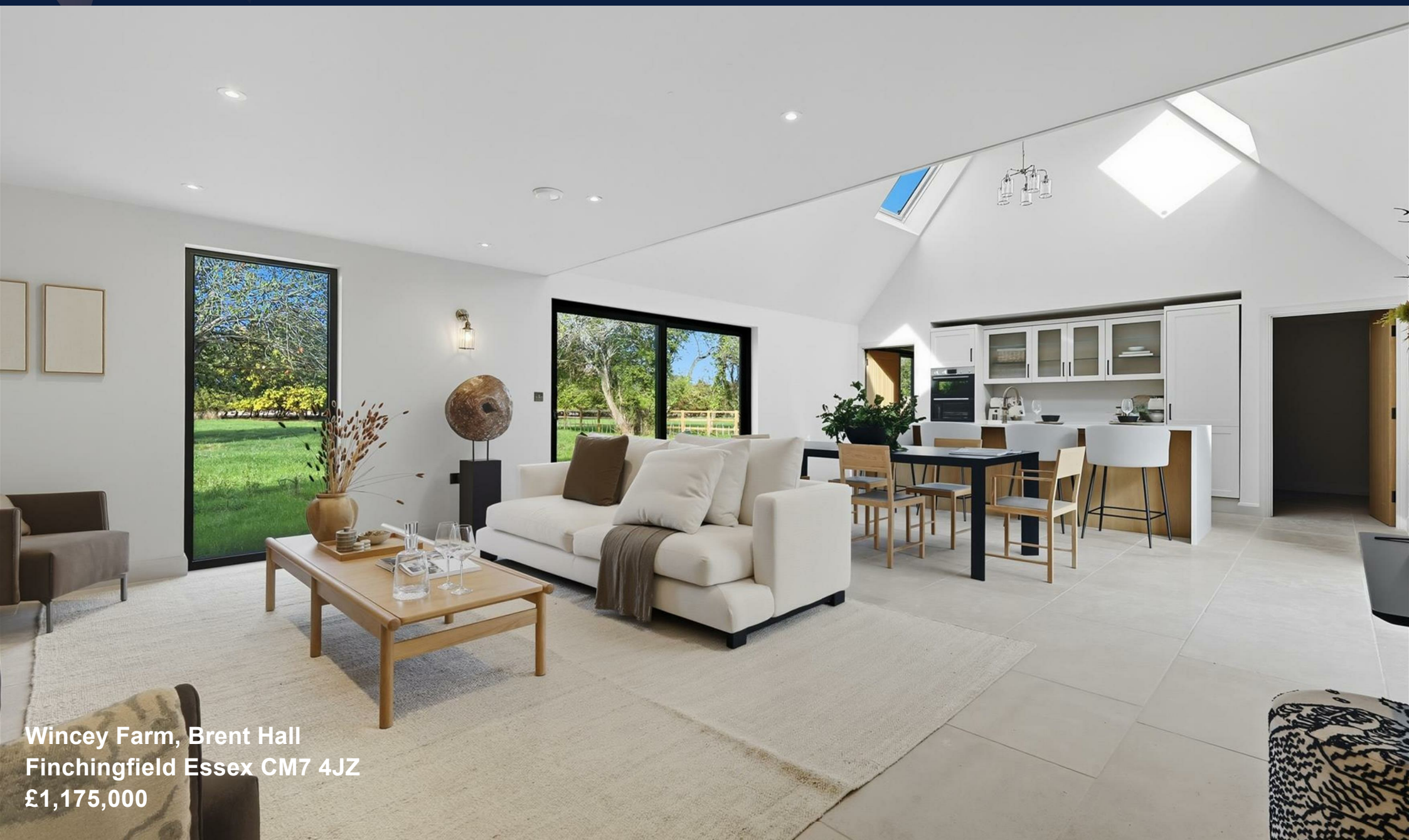
Wincey Farm, Brent Hall Finchingfield Essex CM7 4JZ £1,175,000